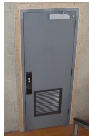
New, New Wing bathroom door.