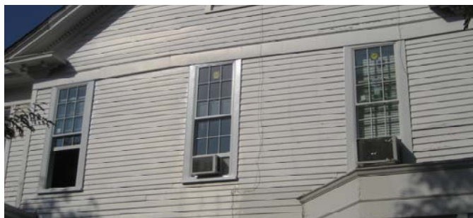
Three new Pella windows were installed on the south side of the Old Wing.