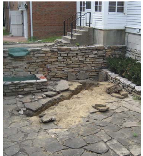
Improvement projects included (Left) new powder room doors and automatic light sensors, (Center) new paint, bunk beds, and a ceiling fan installed in Blue Room/EDL with help from Harry "Scooter" Smith '68, Dave Hellwig '73, and Donn Yeagley '73, and (Right) a sump pump and drainage in the sunken garden.