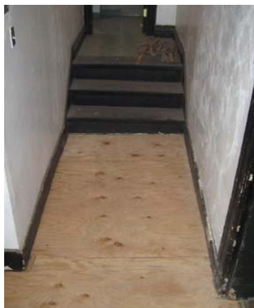
New sub-floor outside Old Wing bathroom.