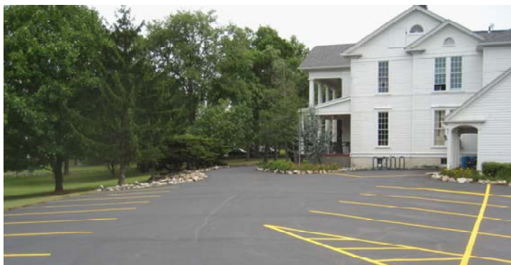
After the circle drive was dug up and a new drain pipe was installed, the driveway and parking lot were repaired, and a new top coat/sealant were applied. The parking lot was then re-stripped and spots were numbered.

Wynn (Wheels) Wiegand, '74 President, MO Alpha House Corp.