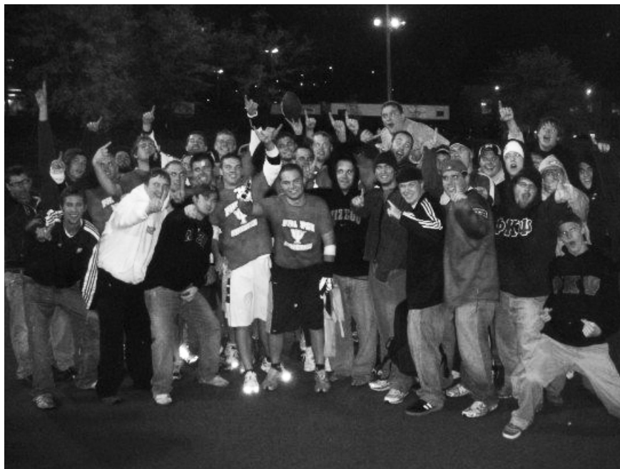
Members of the chapter celebrates after Phi Kappa Psi wins the Greek championship in flag football.

After a successful Tiger football season, we hope to welcome many more alumni back to the chapter house in the fall. We invite you to stop by at any time to re-visit your college home.