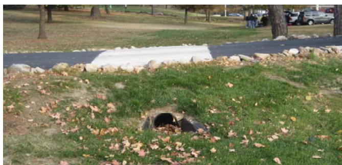
The driveway was dug up and a new drain pipe laid to prevent "Lake Phi Psi."